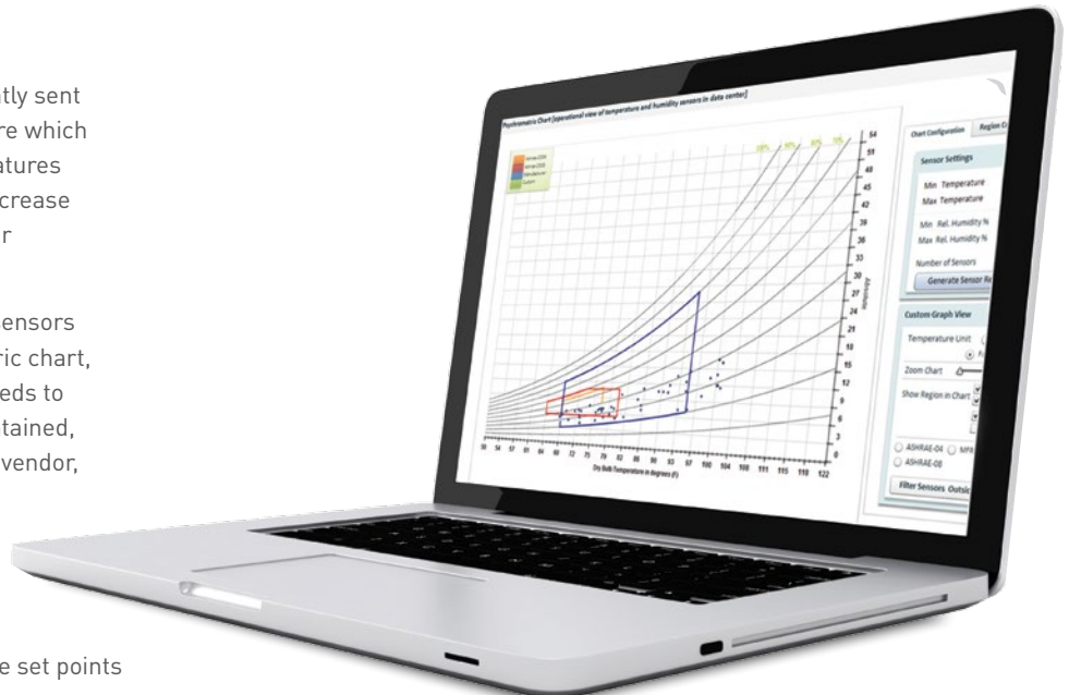
Patented Real-Time Psychrometric Charts